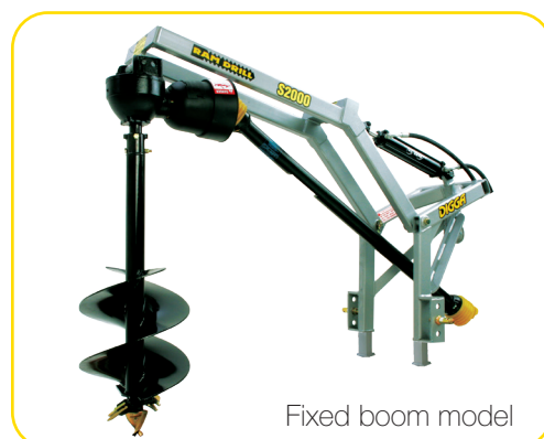
Fixed boom model