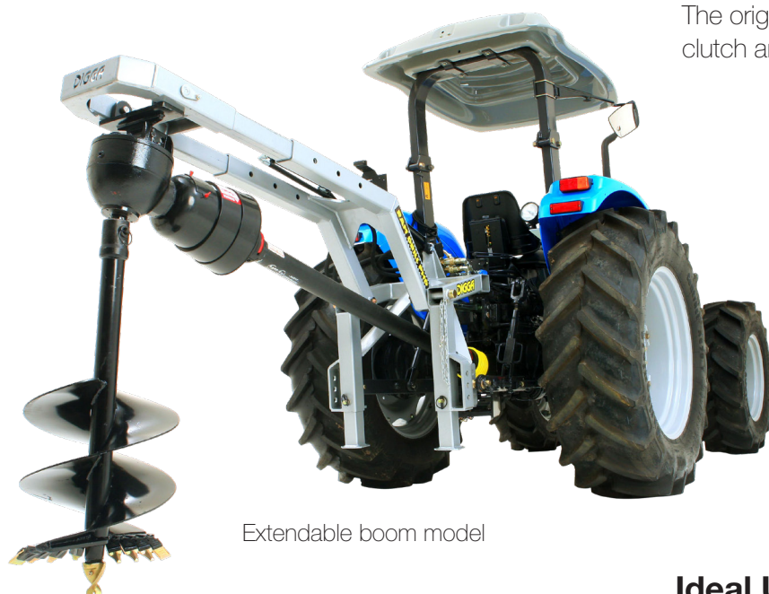
Extendable boom model

The original PTO driven, down pressure drill with heavy duty clutch and frame. Easy to install and store.